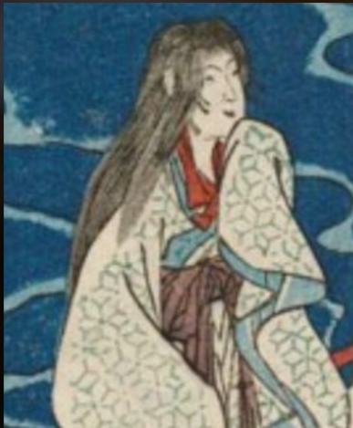
IZANAMI NO MIKOTO