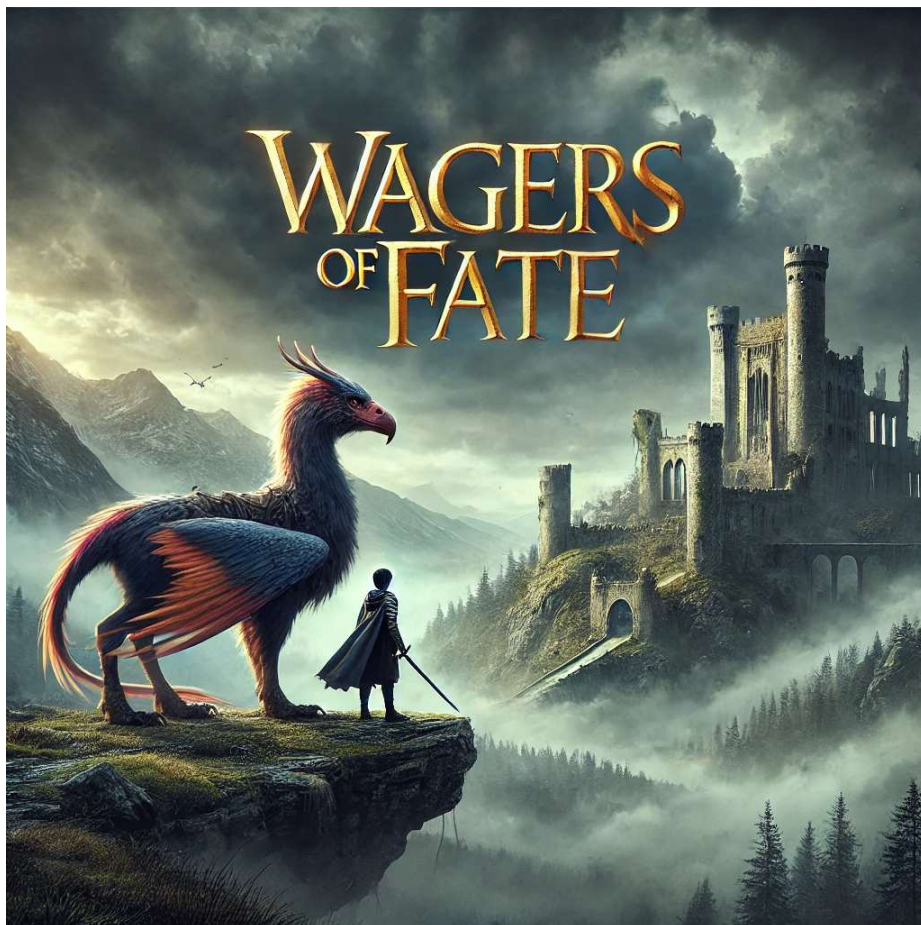
HECTOR AND FULGUR THE HIPPOGRIFF AND THE 108 TH STAR OF DESTINY