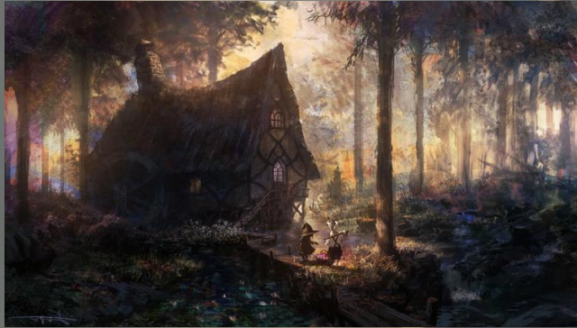
Veserus forest; Alexander's and Naia's cabin. At the limits of human kingdom.