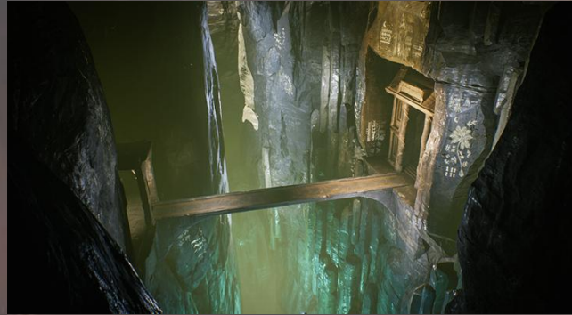
The Fandol Span. Rests in Elevar's lower levels, this is a two way path between the worlds of men and Orcs. The greatest of battles takes place on that bridge..