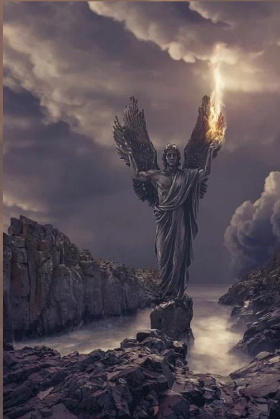
Solgar. Just outside Elevar, this is where the prophecy begins and all magic fails.