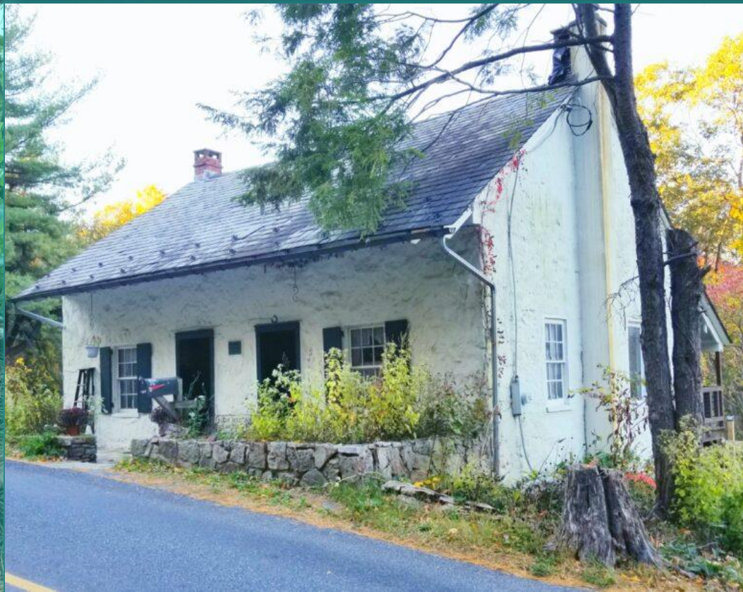
The Actual Schaumbach's Tavern Still Stands Today