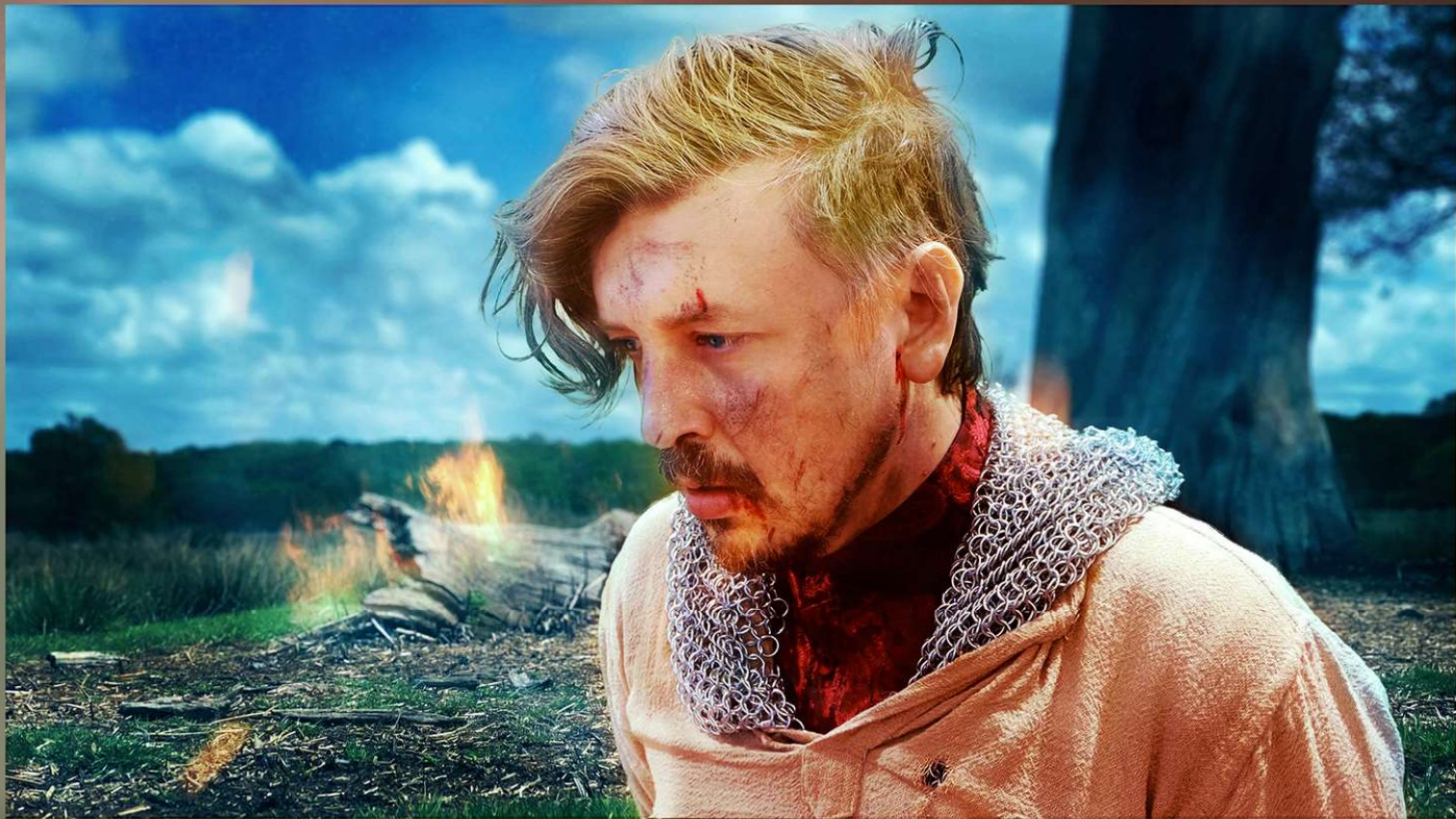
Make-up / Costume / VFX tests