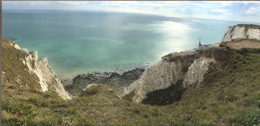
Locations and Concepts