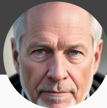
Governor Thomas Lee

A powerful and ruthless leader of the United States, with a deep-seated hatred of the Confederacy.