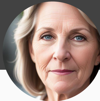
President Emily Carter

A young Black man growing up in Atlanta, Georgia. He faces systemic racism and inequality but is determined to forge a path for himself. Enlists in the Georgian military as tensions escalate.