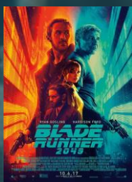
Blader Runner 2049 (2017)