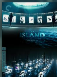
The Island (2005)