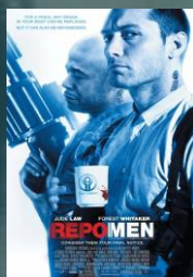
Repo Man (2010)